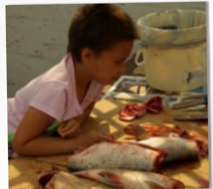
WORKING ON FISH